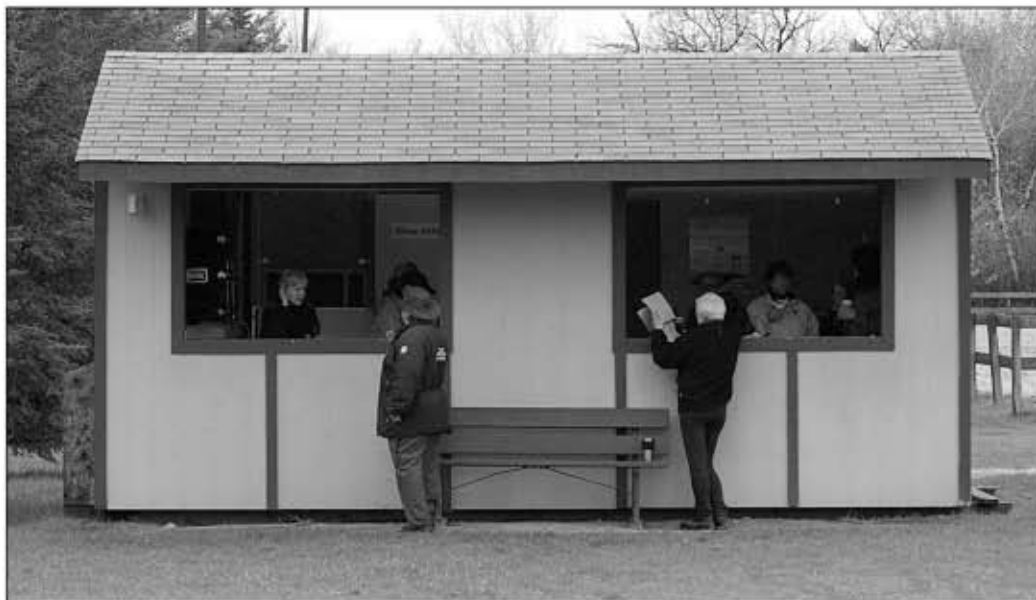
The show office is always a hub of the action during a dressage show.