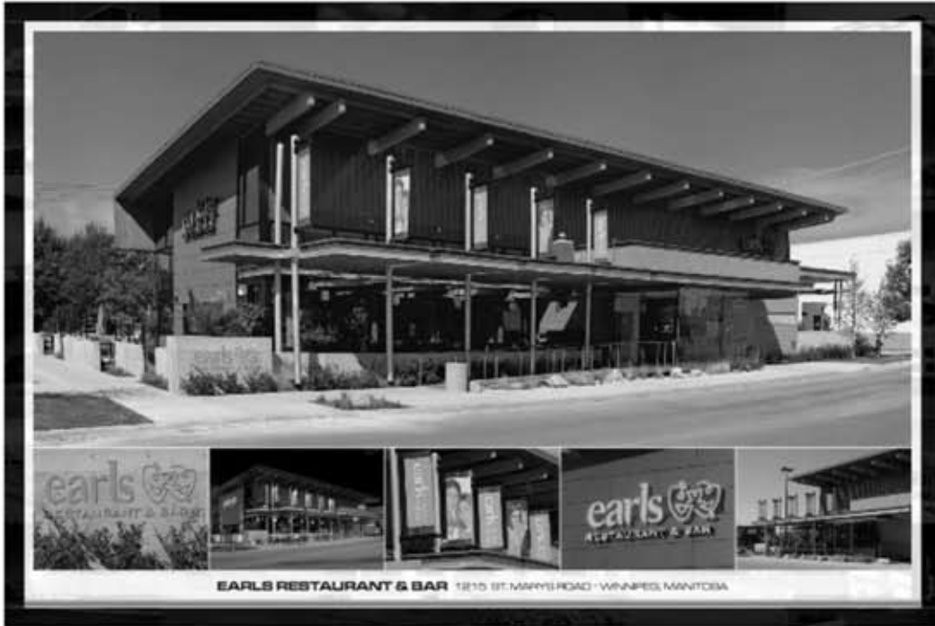
EARLS RESTAURANT & BAR 1215 ST. MARYS ROAD - WINNIPEG, MANITOBA