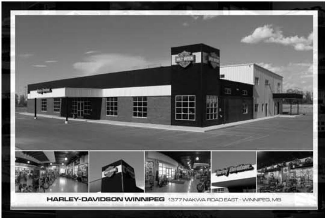
HARLEY-DAVIDSON WINNIPEG 1377 NAKWA ROAD EAST - WINNIPEG, MB