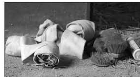
Polo wraps, grooming brushes show signs of good use.