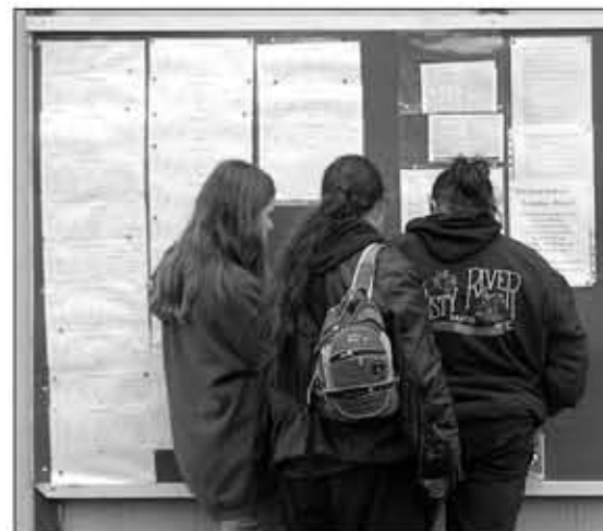
The results board is always one of the most-visited areas during a show.